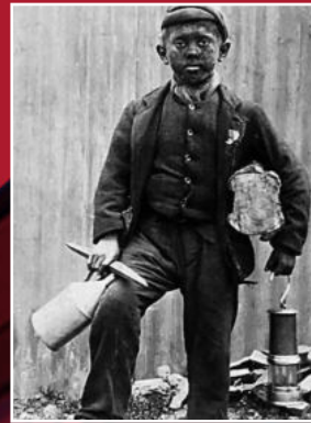
FERNDALE Community School