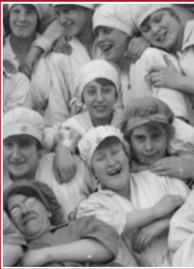
THORNHILL Primary School

FRIDAY 5TH JULY, 2019 at the National Waterfront Museum of Wales, Swansea.